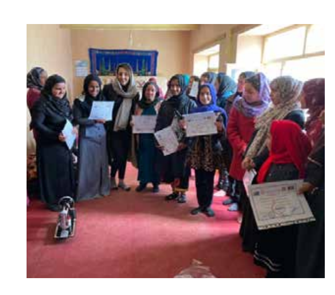
Since 2004, a total of 1,850 in 70 villages have had received the gift of education from AADO's donors.

The second semester of the program has taught the women dressmaking, tailoring and embroidery. Each woman receives a sewing machine upon graduation. The sewing skills equip them to make clothes, school uniforms or more complicated articles which in turn can lead to selling clothes either at markets or in the villages. Working together as neighbours and a community, many friendships and partnerships are formed. All women are encouraged to cooperate and work together.